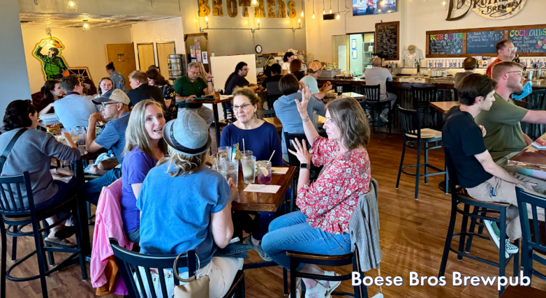
Boese Bros Brewpub