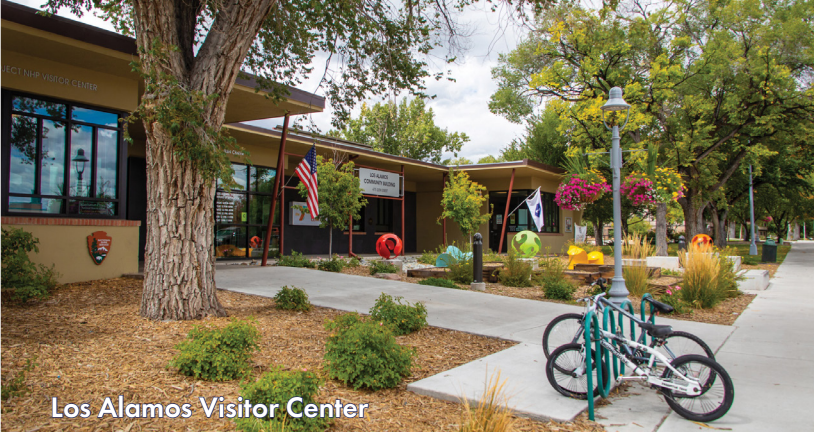
Los Alamos Visitor Center