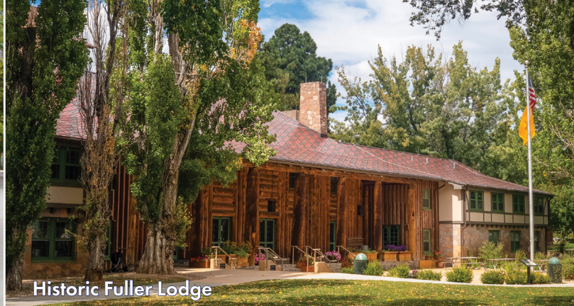
Historic Fuller Lodge