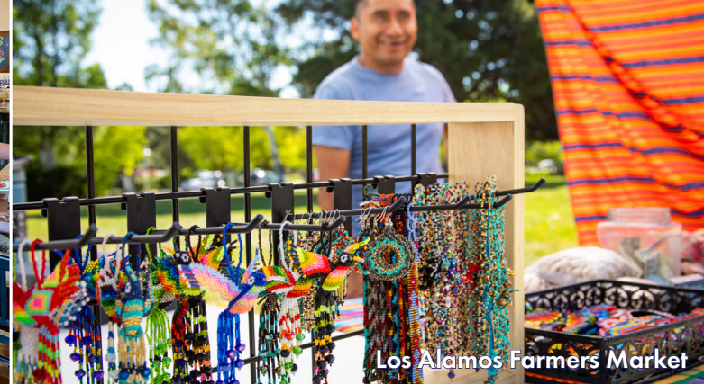
Los Alamos Farmers Market