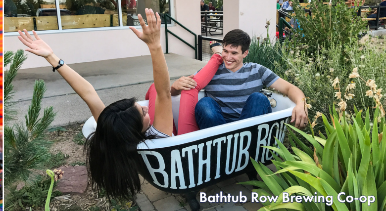
Bath Tub Row Brewing Co-op